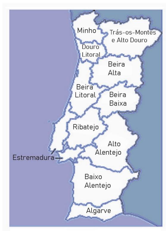
Map 1. The 1936 provinces of Continental Portugal.