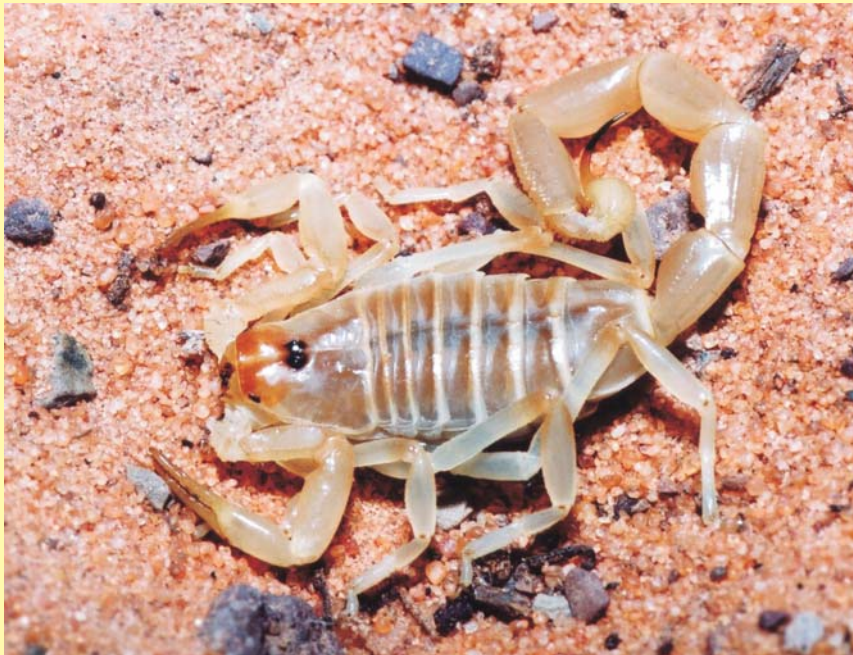
Fig. 43. Buthacus occidentalis . Female from Chinguetti-Atar in its natural habitat.