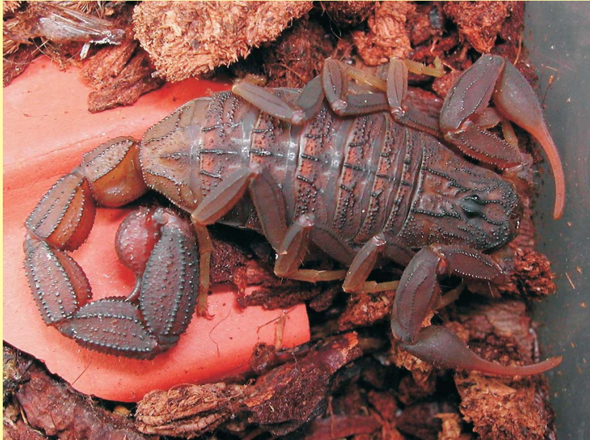
Fig. 1. Habitus of Hottentotta hottentotta , female from Mont Nimba, Guinea (from Vachon & Stockmann, 1968). Total length 72 mm.