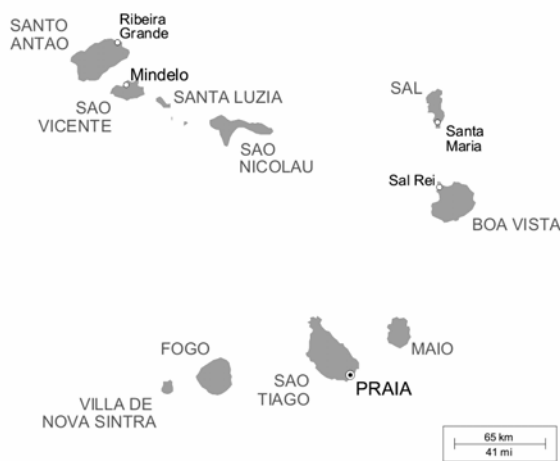
Fig. 14. Map of the Cape Verde Islands showing the location of the islands.

carinae; segment V with five crenulate carinae; lateral in-framedian carina slightly incomplete on segment IV; all segments with a smooth dorsal depression, with some isolated granules. Intercarinal spaces moderately to intensely granular. Telson smooth dorsally and granular latero-ventrally, with a moderately short and curved aculeus; subaculear tooth vestigial. Cheliceral dentition as defined by Vachon (1963) for the family Buthidae; movable finger with the external distal tooth slightly shorter than the internal distal tooth, and the basal teeth strongly reduced; ventral aspect of both finger and manus covered with setae. Pedipalps: femur pentacarinat; patella with seven moderately marked carinae; chela smooth without carinae; tegument from moderately granular to almost smooth. Fixed and movable fingers with 12-13 oblique rows of granules; internal and external accessory granules present; distal extremity of movable fingers with four granules. Legs: tarsus ventrally with two longitudinal rows of 6/8 spines. Tibial spurs present on legs III and IV; prolateral and retrolateral spurs present in all legs. Trichobothriotaxy: Trichobothrial pattern of Type A, orthobothriotaxic as defined by Vachon (1974). Dorsal trichobothria of femur arranged in \beta (beta) configuration (Vachon, 1975).