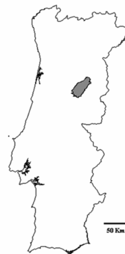
Fig. 1. Location of the PNSE in continental Portugal. →

Despite the large area and wide altitudinal range of Serra da Estrela Natural Park, until now no work has been specifically devoted to its arachnological fauna. Furthermore, the bibliographic data available is scattered through 15 works. Simon (1875 and 1914) made the first two additions to the Park's arachnofauna. With the works of Bacelar (1927, 1928, 1933 and 1940) and Machado (1949) the number of known spider species was raised to 18. Recently Ferrández (1985 and 1990), Alderweireldt & Bosmans (2001) and Pekár et al. (2003) added three new species to the Park's catalogue. Very recently Cardoso (2006) has made available online part of the information contained in the collection of António de Barros Machado, which added a significant number of species for PNSE (24 in total). Fernández (1910), Urones (1995) and Morano (2005) also have references to the Park's arachnofauna, but no new data is supplied.