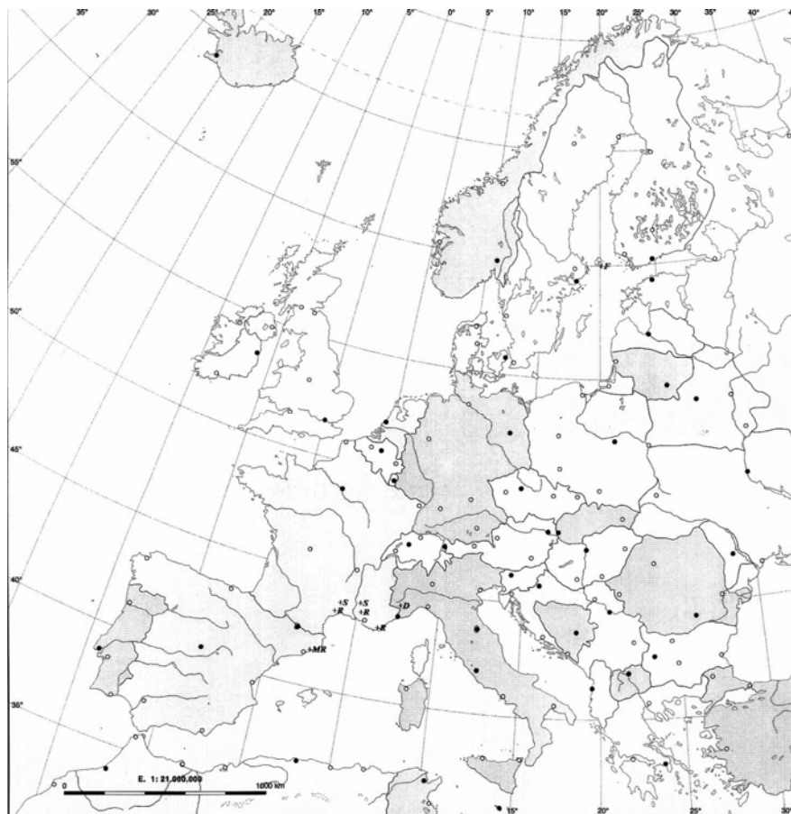
Fig. 36. Geographical distribution of all known records of Microselia in Europe. Abbreviations: D = M. daccordii , F = M. forsiusi , M = M. micropila , R = M. rivierae , S = M. southwoodi . →