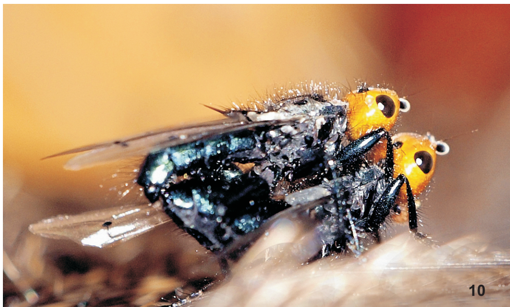
Fig. 7-10. Thyreophora cynophila (Panzer, 1794): 7) habitus (female). 8-9. couple not mating; 10. couple mating.