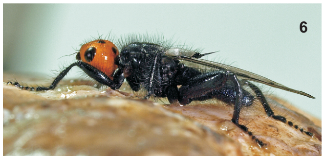
Fig. 1-6. Thyreophora cynophila (Panzer, 1794): 1. habitus, detail of the general photograph; 2. habitus, general photograph; 3. habitus (male); 4. detail of the head (male). 5-6. habitus in different angles (males).