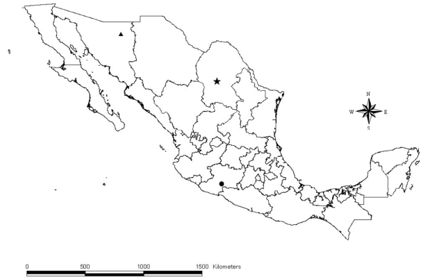
Map 1. Distribution of Kuarapu purhepecha , sp. nov., in Michoacan (circle), and its geographically nearest relatives: Serradigitus agilis in Sonora (triangle) and Serradigitus calidus in Coahuila (star).

ETYMOLOGY. “Kuarapu” is used as a noun in apposition, and it means “scorpion” in the language of the Tarascan Indians that inhabit the state of Michoacan. It is masculine in gender.