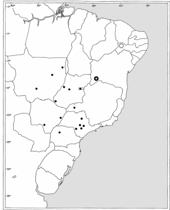
Fig. 12. Map showing the known distribution of the Ananteris species discussed in the paper. Ananteris balzanii (black circle). Ananteris franckei (●), Ananteris evellynae sp. n. (K).